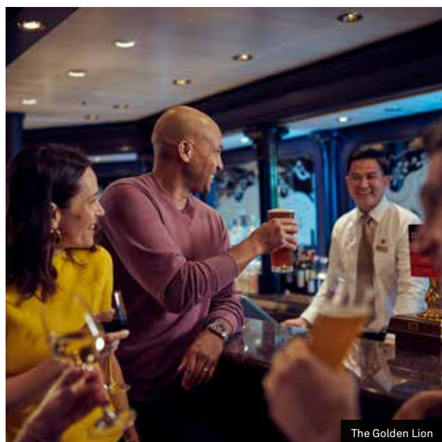
The Golden Lion

On board Queen Elizabeth, guests can visit some of the most beautiful and far-flung parts of the world. These include some of the world's most iconic destinations such as Sydney Harbour, Fjordland in New Zealand, and the glaciers of Alaska.