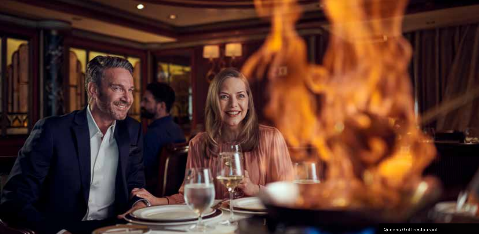
Queens Grill restaurant