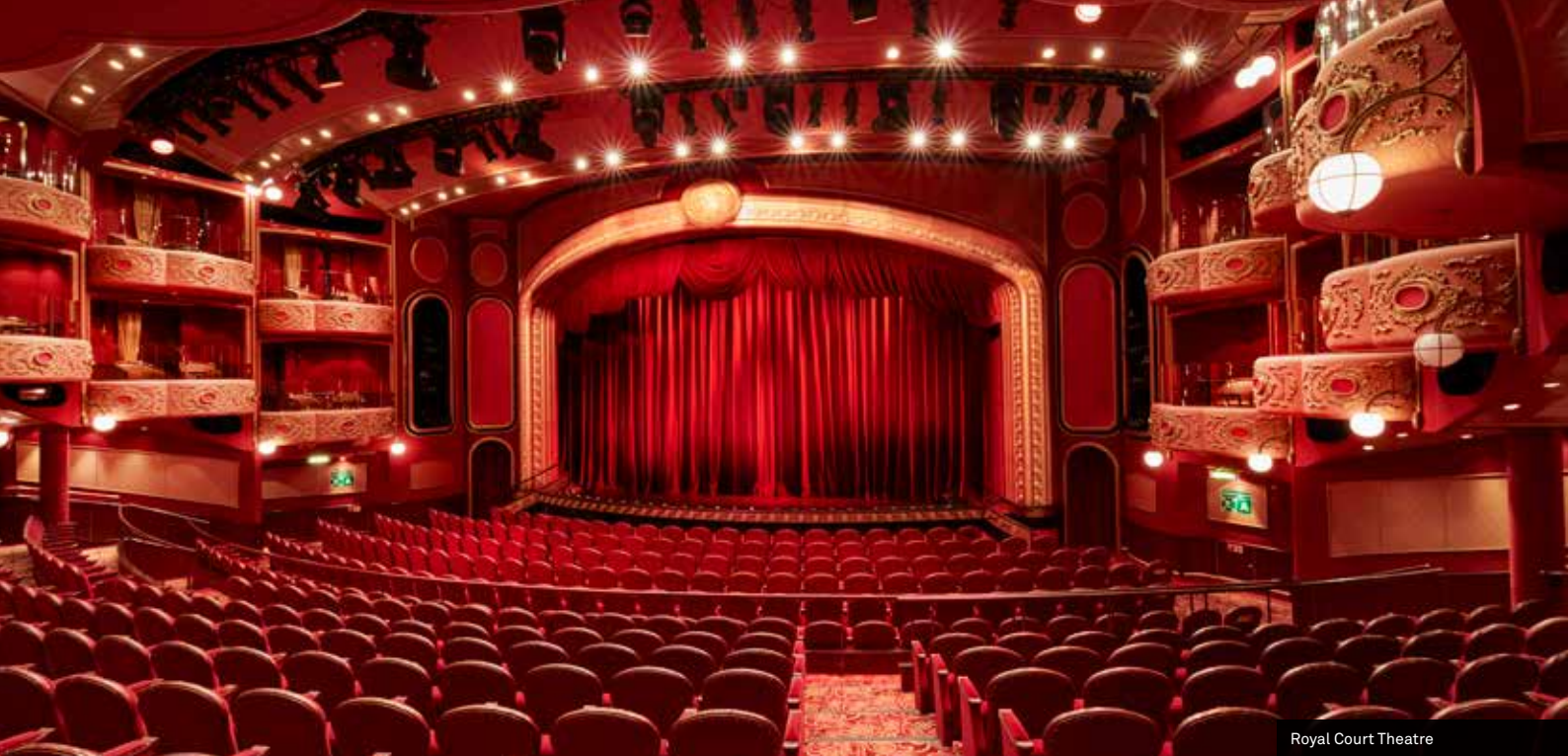
Royal Court Theatre