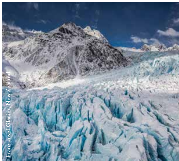
Franz Josef Glacier, New Zealand