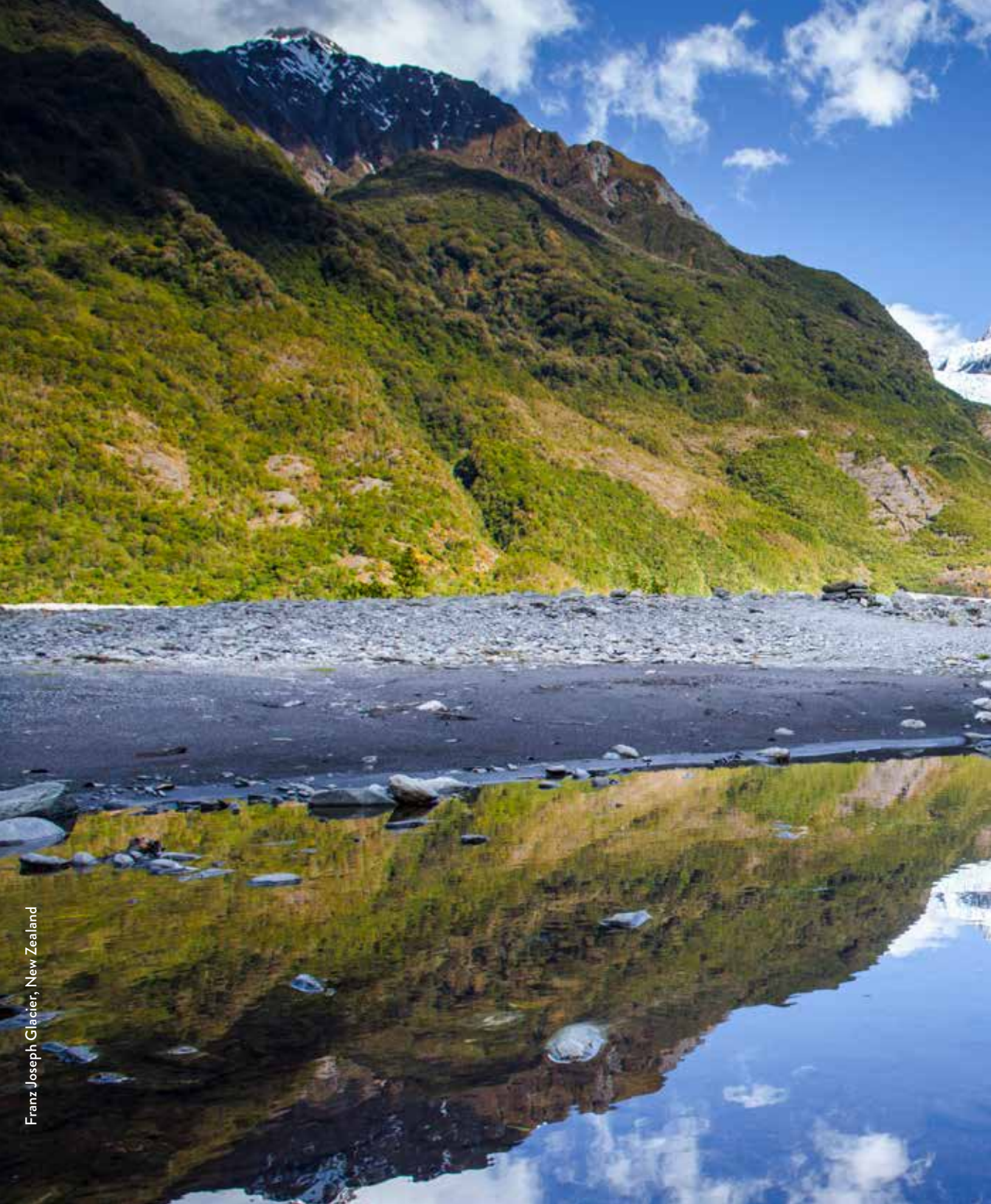
Franz Joseph Glacier, New Zealand