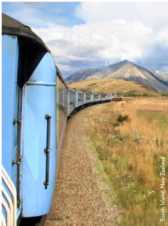
South Island, New Zealand