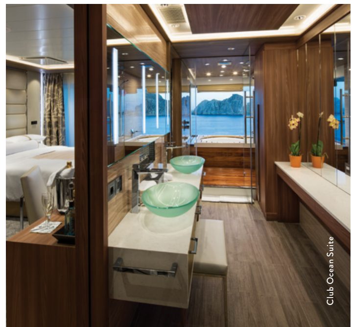
Club Ocean Suite