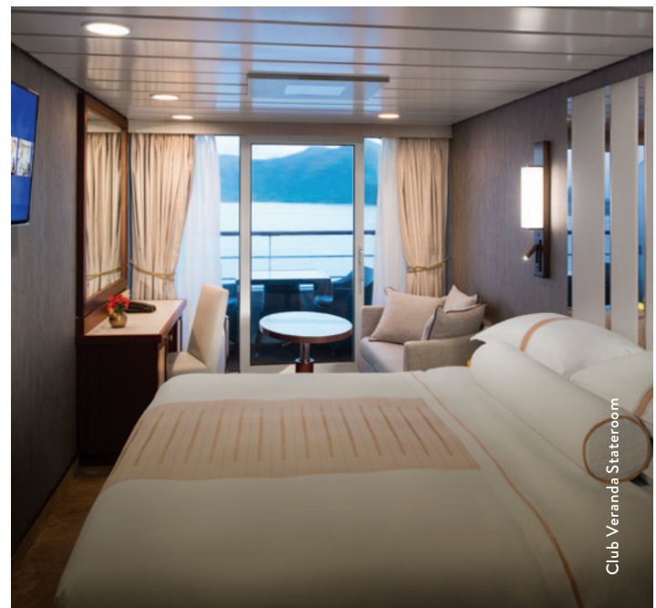
Club Veranda Stateroom