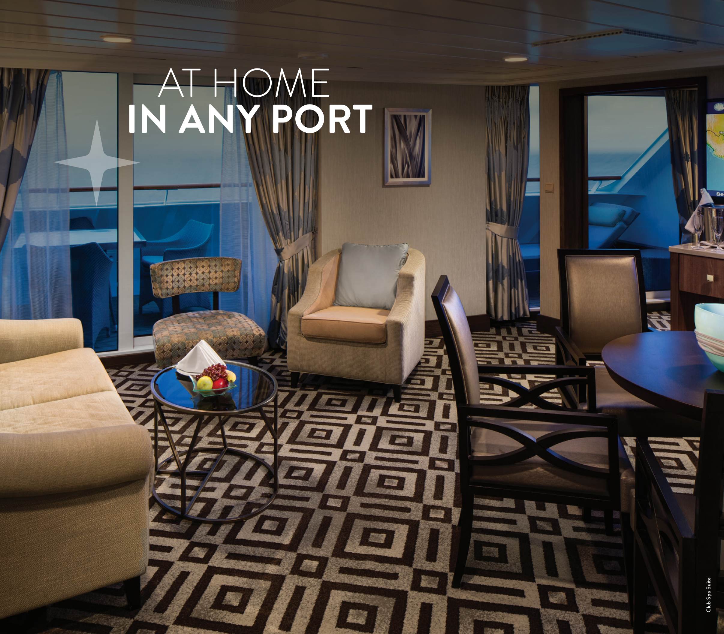
Club Spa Suite